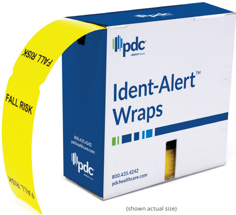
(shown actual size)

Organize multiple Ident-Alert™ Wraps boxes for quick access and dispensing, when and where you need them. Boxes fit neatly on a shelf, desktop, or cart.